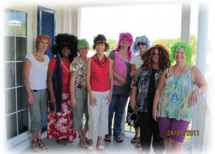
P.A.L.S. Mad Hair Day