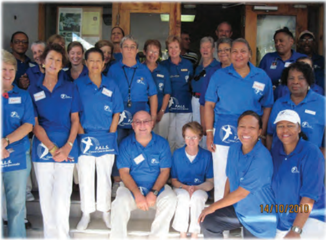
Volunteers at P.A.L.S. Fair