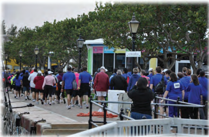
P.A.L.S. Annual Sponsored Walk